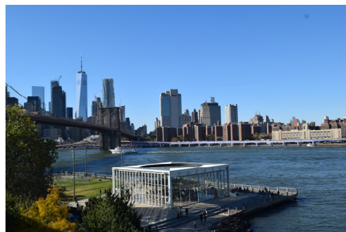
Jane's Carousel, Brooklyn Bridge Park

Please join us on a wonderful spring trip to New York City, where we will visit the Brooklyn Bridge Park and the Brooklyn Botanic Garden. We will depart from Timonium at 6:30 AM and travel to Brooklyn, New York. We will first visit the Brooklyn Bridge Park which is world-class waterfront park with rolling hills, riverfront promenades, lush gardens, and spectacular views of lower Manhattan. The Park is an 85-acre waterfront site stretching 1.3 miles along Brooklyn's East River edge. Upon arrival, we will tour one of the main piers, with the Park's horticulture staff, who will talk about the history of the Park and logistics of transforming the piers of the former Brooklyn shipping terminal into the vibrant waterfront park. After the tour we will have several hours to get lunch and explore the park on our own.