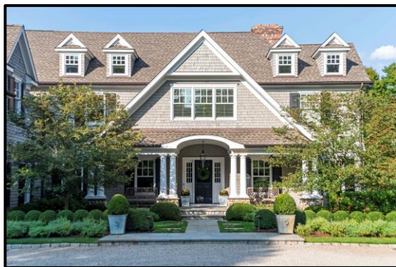
Allan Broadbent, Landscape Architect

How do you get curb appeal when you have a really protracted view of the house 100' from the road and the foundation planting is really tough to see at a distance? An allee of trees gives you that bridge between the house and the street. The allee becomes the curb appeal drama and the foundation planting is secondary to that device. An allee can also reduce the mass of the house so you just see the center volume. The foundation planting is kept simple.