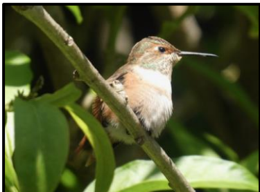
Hummingbird

ALL Students and Consultants MUST keep accurate, up-to-date records of courses completed to become a Consultant in each of the three schools, Environmental, Gardening, and/or Landscape Design. The only person maintaining Student Records is the School Chairman (or State President if there is no designated State School Chairman) in the state you live in or designate as the holder of Student(s) and Consultant(s) records. The Data Base of School Records at the NGC Headquarters starts when Consultant status has been achieved when all four courses in a given school have successfully been completed and properly recorded.