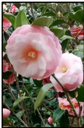
Camellias from South Carolina

I have been including articles on historic landscape design in our SC newsletters and these have had an excellent response from our members. I started with the Egyptians and am currently up to the Renaissance. Here is a thumbnail outline from my articles so far: