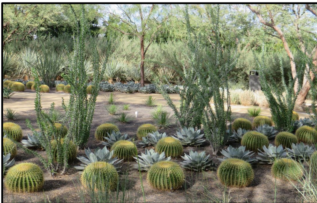
Sunnylands, Palm Springs, CA

All submissions must be original material. Photos are welcome! Please send articles in Word format and photos to the Editor at CSCarbaugh@verizon.net .