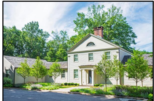
Allan Broadbent, Landscape Architect

balanced, orderly and stunning elegance with year-round interest. (See photo below.)