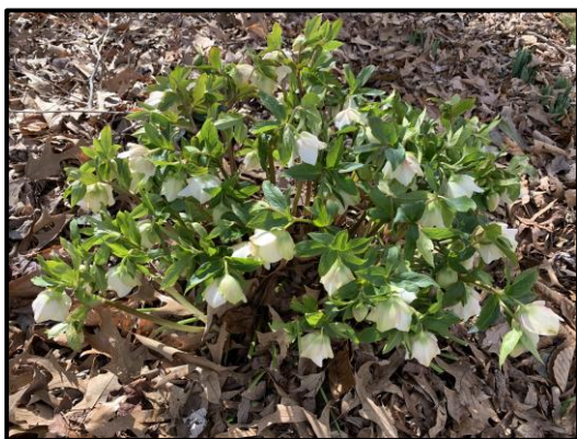
Hellebores

The Directory of Landscape Design Schools and Councils Chairs is now located on the Schools Resources page, at the bottom under School Chairmen Directories at https://www.gardenclub.org/school/schools-resources .