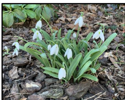
Snowdrops, a sign of spring

I am pleased to report that after the pandemic brought Landscape Design School courses to a halt for a while, a number of courses have been conducted since last Fall, both by Zoom and in the classroom. More are planned. Check the NGC website (you now have to click on the tab for each course in order to view all course listings), Keeping in Touch and page 6 of this newsletter for course listings.