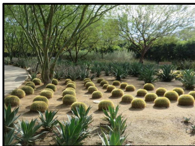
Sunnylands, Palm Springs, CA