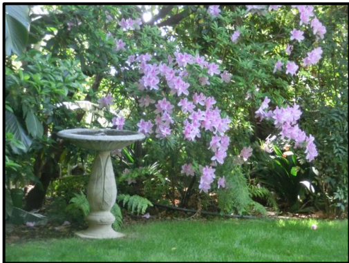
Azaleas in Bloom in February in CA

storms passed through the southland, this year's current total is less than 6 inches. But even with the smallest amount of moisture weeds germinate and in what seems like 24 hours...are a foot tall. So, one task performed more often is keeping my planting beds clear of these pesky weeds. And, although it seems strange, I find weeding very therapeutic and relaxing.