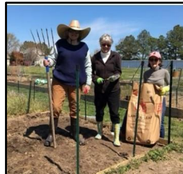
Oxford Garden Club Community Garden Ready for Planting, after removing weeds, tilling and amending the soil and installing a fence.