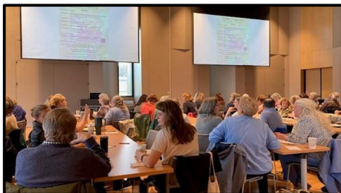
Mountain Laurel Native Plant Symposium

PLANTING NATIVE: Many of our clubs sponsor Native Plant Sales. Plants are started from seed, dug from member gardens or purchased from specialty wholesalers. We have seen public awareness of their importance to the eco-system grow. Mountain Laurel Garden Club sponsored a full day symposium on native plants for their community– the 200-person event sold out in two weeks.