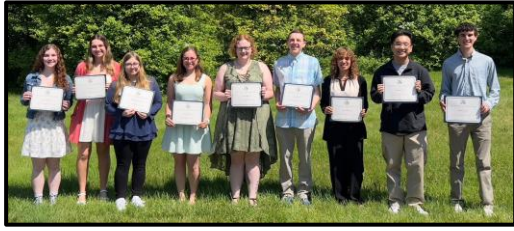
GCNJ Scholarship Winners for 2024