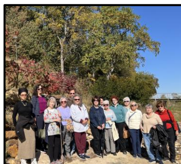
LDC shoreline tour

CAR-SGC CONFERENCE: Congratulations to New Jersey for a successful 2024 conference. Save the date for October 19-21 (bus tour on 22 nd ) for the 2025 Conference/Tri-Refresher to be held in Maryland. Hope you'll join us.