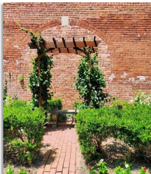
Rescue Mission ...the old jail yard

Another community project close to our hearts is the Frederick Rescue Mission Gardens. The photo shows the old jail yard out back. The old fountain which was cracked at one time is boasting spectacular sedums and the pergola has gorgeous happy honeysuckle climbing up both sides! Vegetables and herbs and being added as we go through the warmer months!