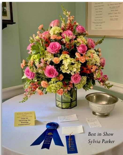
Best in Show Sylvia Parker

The Homeland Garden Club is grateful to the Woman's Club of Roland Park for allowing us to hold our show in the beautiful, historic house and gardens. It is the tradition of the HGC to host a show every other year. We look forward to our next show in 2025!