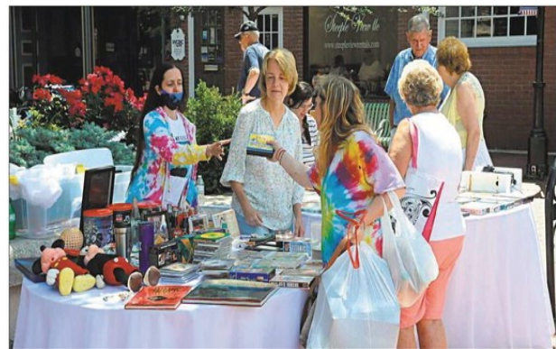
Customers peruse items for purchase at the Let's Beautify Cumberland! and Cumberland Garden Club table during the National Road Yard Sale Friday afternoon on the downtown mall.