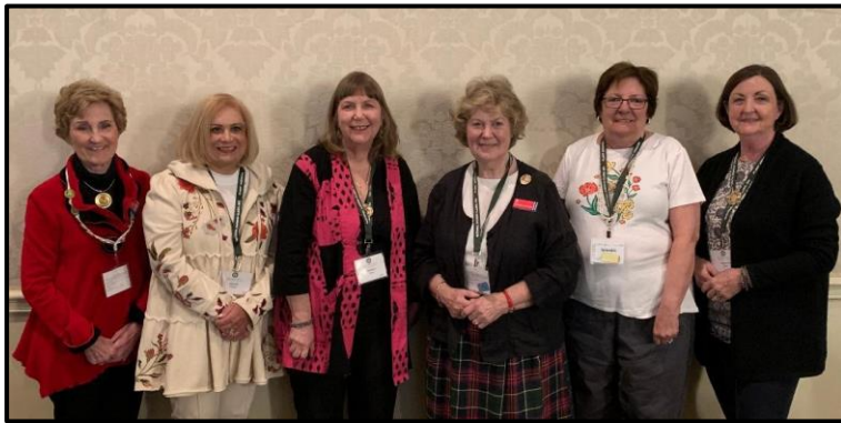
Incoming State Presidents