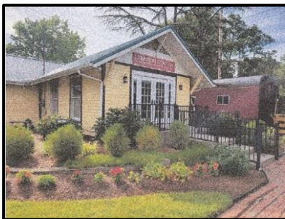
Town & Country Garden Club - Lebanon OH