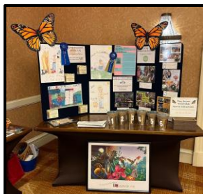
Youth Club Activities on display at the GCNJ Annual Meeting