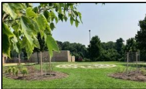
Finished plantings

The school is very happy with the new look. We have reduced lawn, created a wildlife habitat, educated students about biodiversity, and created a welcoming front yard.