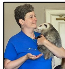
Sweet Pea, the opossum

Our Districts provided delightful and energetic meetings celebrating their new administrations.