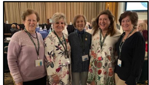
From the National Capital Area