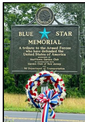
Snufftown Garden Club's newly dedicated Blue Star Memorial Marker