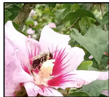
Bee on Rose of Sharon

So just what is a pollinator pathway? I'll pull that answer straight from the webpage of Pollinator Pathway, an organization based in Connecticut that encourages the formation of these pathways. Pollinator pathways are "Public and private pesticide-free corridors of native plants that provide nutrition and habitat for pollinating insects and birds. Even the smallest green spaces, like flower boxes and curb strips, can be part of a pathway."