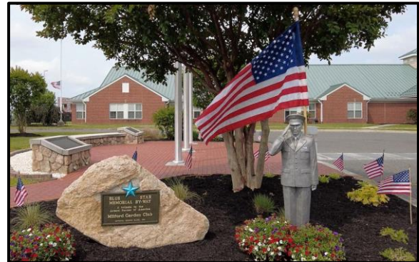
Milford Garden Club's Blue Star Memorial dedicated in May 2023

recognizable in their communities. Many clubs meet throughout the summer months maintaining community gardens and historic sites. Their visibility generates interest in becoming a garden club member.