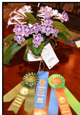
Garden Gate Garden Club's Flower Show “It's Not Easy Being Green”, Horticulture Excellence and Design Excellence