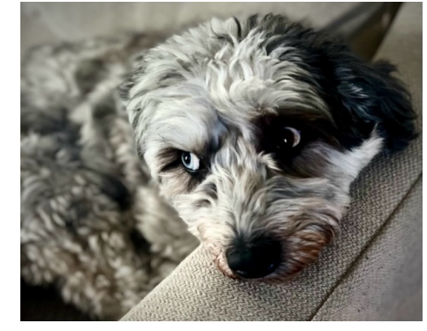
Portrait - Stage Light Mono